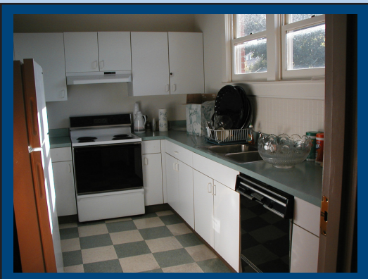
A full kitchen with plenty of storage space.