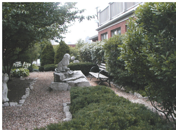
The Reading Garden between Thurber Center and Thurber House is a great place for a time out.

Thurber Center is a smoke-free facility, and wheelchair accessible.