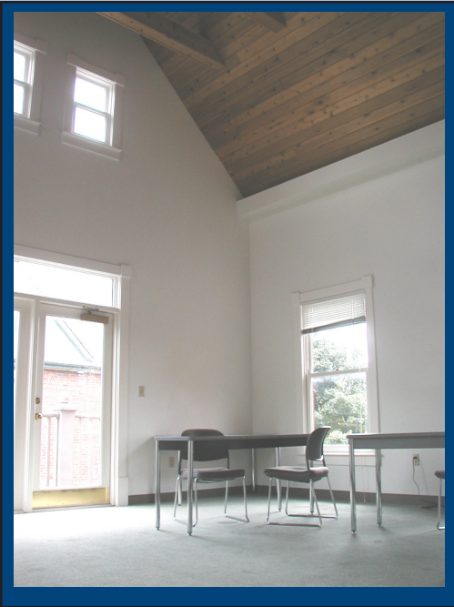
The New Yorker Room, airy and light-filled with a soaring vaulted ceiling.