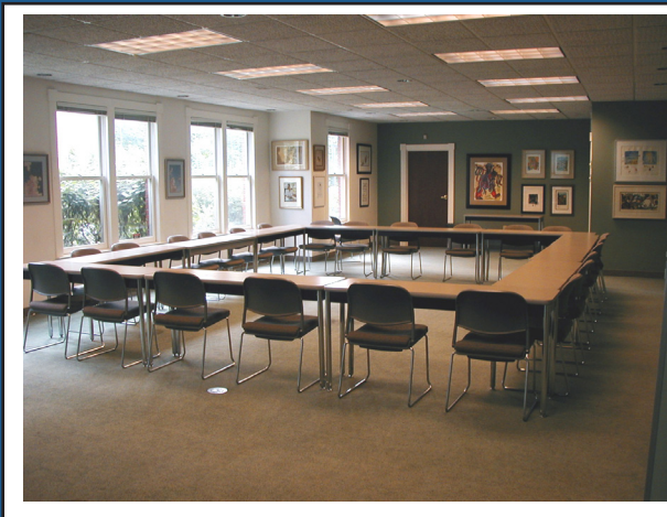
The Algonquin Room is Thurber Center's largest room; it also houses exhibitions of Thurber art.

*Rates do not include set-up and other charges. Discounts available for non-profit organizations.